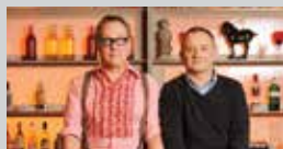
Reeves and Mortimer Heading for a big night out