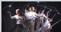
Rambert Dance Co They're the greatest dancers...