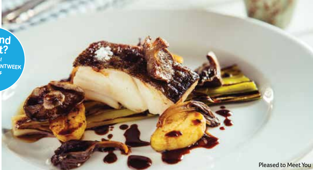
Pleased to Meet You